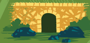
HALIFAX UNDERGROUND RAILROAD TRAIL