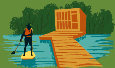
TAR-PAMLICO WATER TRAIL