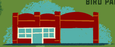
TARBORO BREWING COMPANY