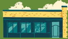
BLUE JAY BISTRO