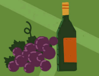
SEVEN SPRINGS FARM & VINEYARD