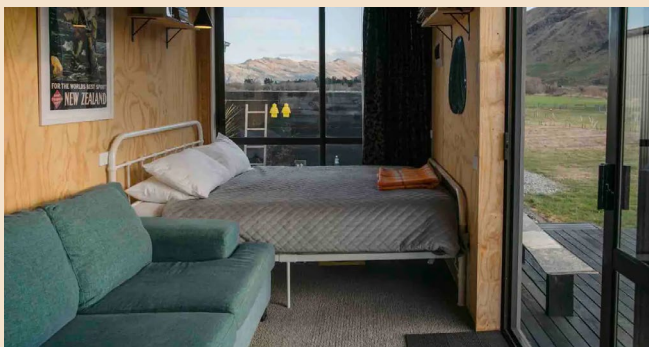
Eco cabin between Queenstown and Milford Sound Kingston, Southland, New Zealand