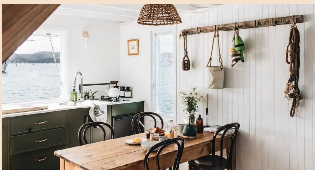
Salty Dog New South Wales, Australia