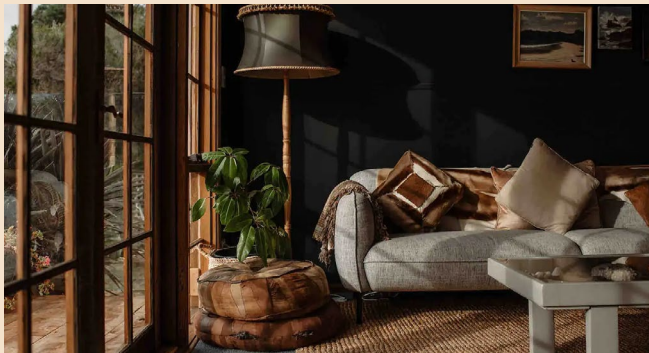
Beachfront: House of the Weedy Seadragon Eaglehawk Neck, Tasmania, Australia