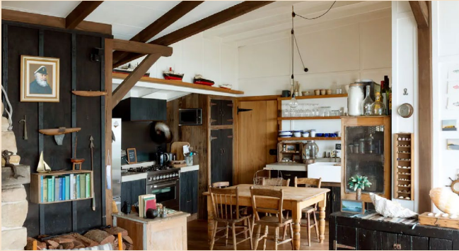
The Little Black Shack Great Mackerel Beach, New South Wales, Australia