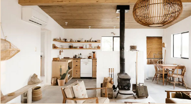
Joshua Tree Little Jo Cabin California, United States