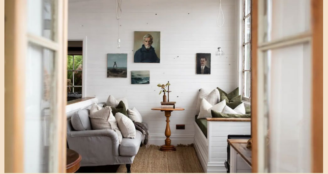
Captain's Rest Tasmania, Australia