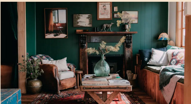
Coldwater Cabins Miena, Tasmania, Australia