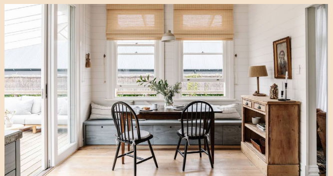
Sailors Whisk Flinders, Victoria, Australia