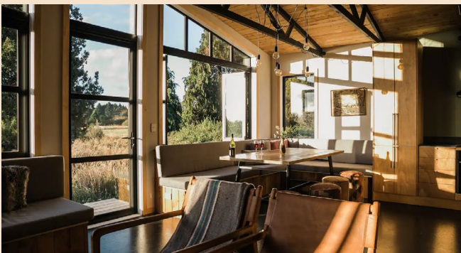
Redrock Hut Ohajune, New Zealand