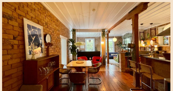
Historic Character CBD Oasis Auckland, New Zealand