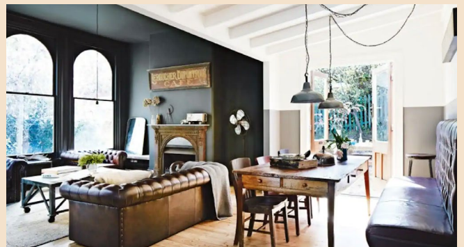
Vintage House Daylesford, Victoria, Australia