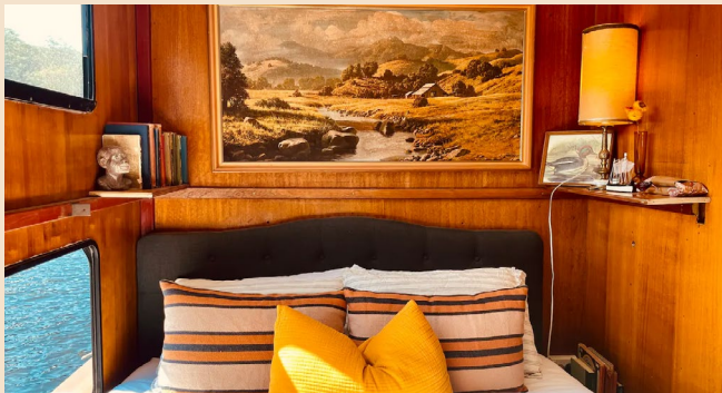
"Oh Buoy" Private Island Escape Berowra, New South Wales, Australia