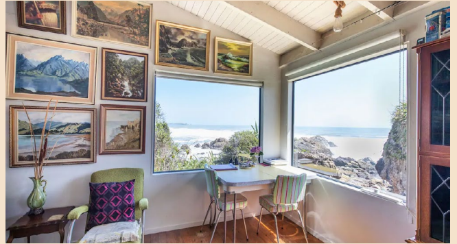
Woodpecker Bay Bach Punakaiki, West Coast, New Zealand