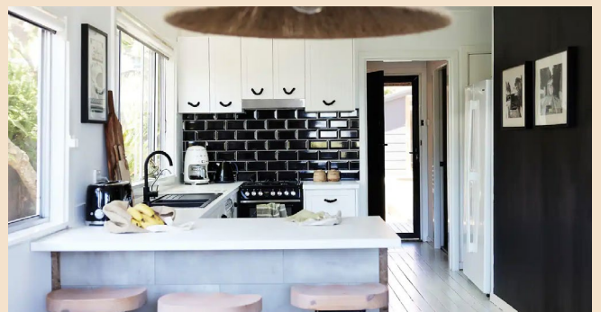
The Black Ace Yamba, New South Wales, Australia