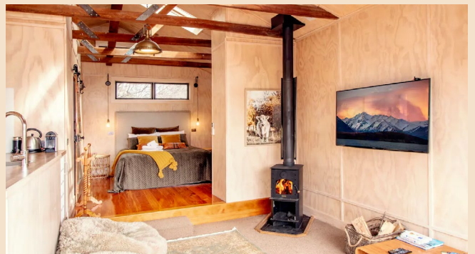
Stargazer's Luxury Retreat Lake Tekapo, New Zealand