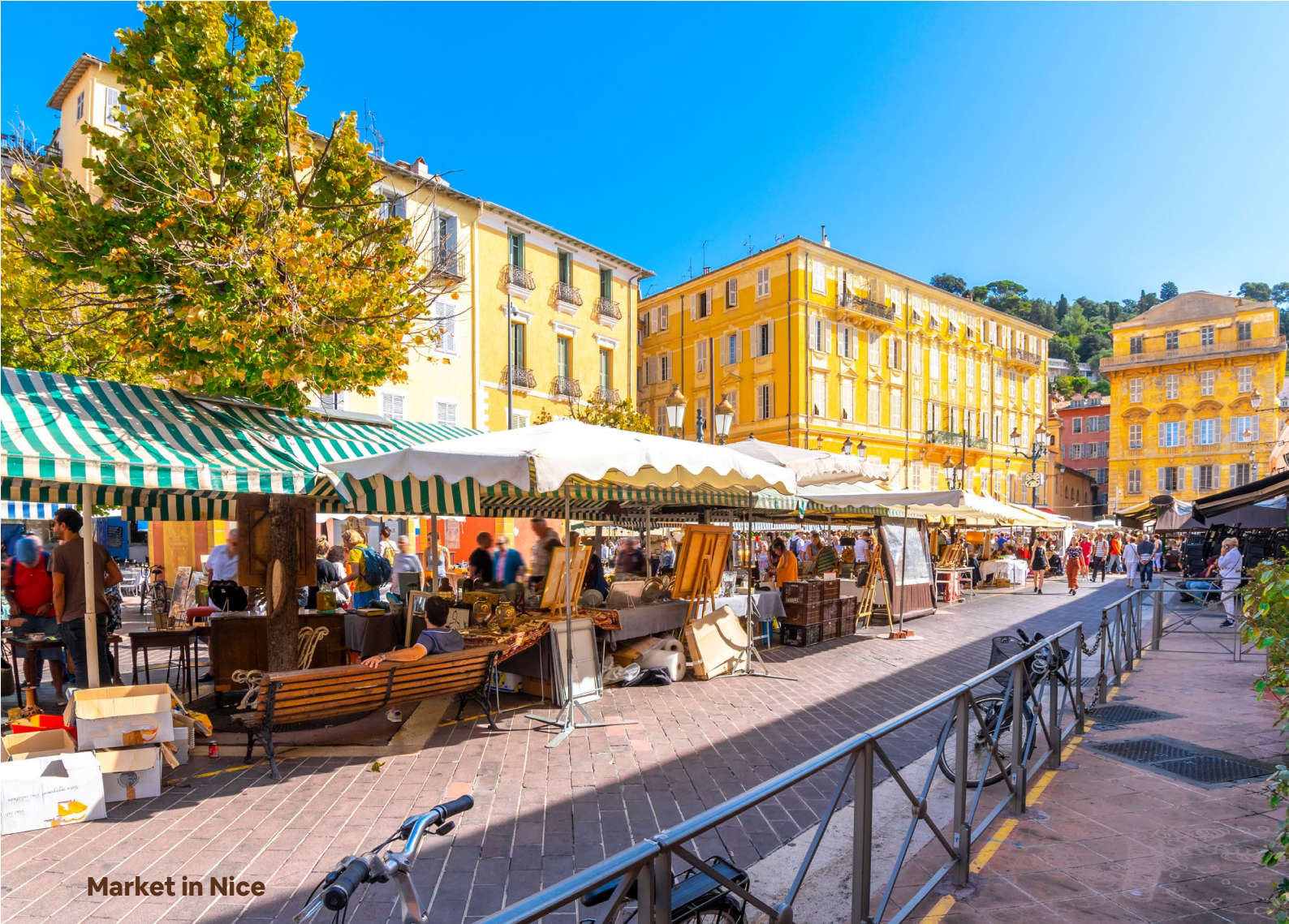
Market in Nice