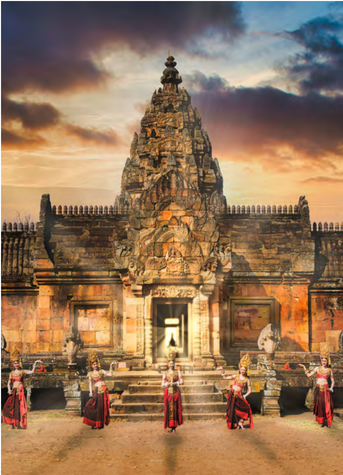
34 Phnom Rung temple in Buriram